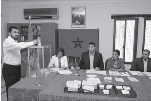
Following the February protests, the king outlined “a package of comprehensive constitutional amendments” to be worked out by a blue-ribbon commission. A new constitution, containing some significant reforms, was composed and voted on in a national referendum on July 1, 2011, only three weeks after its publication.

restored. Overall, the king would continue to be the supreme authority on just about everything of significance: defense, religion, government (he is officially the chairman of the Council of Ministers, with the prime minister filling that role only in his absence), justice (chairman of the Supreme Judicial Council) and security (president of a newly created National Security Council). 16