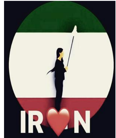
Figure 1. Protester who removed her hijab in the presence of Iranian security forces.

Online social networks played a conspicuous role from the very beginning. Demonstrators used them to transmit messages, publish the dates of demonstrations and their locations, and to disseminate thousands of videos documenting the protests themselves. Although the protests were mainly fueled by economic distress, online social networks were used to convey dissident messages opposing the regime on other issues, such as its investments beyond the borders of Iran at the expense of solving the hardships of its citizens, and the policy of enforcing Islamic law. Thus, for example, the picture of a young woman demonstrator, who took off her hijab (head covering), placed it on a pole and waved it in front of the security forces, became a symbol of the protest (Figure 1). Another manifestation of defiance against the regime was initiated by several dozen members of the Basij militia, which is subordinate to the Revolutionary Guards, who uploaded pictures of their Basij membership cards being burnt (Figure 2).