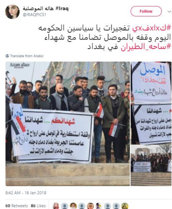
Figure 4: Residents of Mosul demonstrate in solidarity with residents of Baghdad after the double attack. The sign reads “Your shahids (martyrs) [are] our shahids .”

By mounting an attack in the Iraqi capital, ISIS wanted to show not only that it is still active and dangerous, but also that it is no less determined to disrupt political stability in Iraq, especially in the run-up to the May elections. al-Abadi stated, “Our responsibility as a state is to maintain the democratic process and to ensure that the elections are free and fair.” 22 These remarks were also aimed at Sunni and Kurdish politicians who demanded postponing the elections until public security is restored, and until displaced Sunnis and Kurds can return to areas that were controlled by ISIS. They are making this demand out of concern that holding the elections as scheduled will give Shi’a a representational advantage in the new parliament. 23 The Global Coalition against ISIS is also aware of the sensitivity of the security situation in Iraq ahead of the upcoming elections. A Coalition spokesperson said that its forces are working together with the Iraqi security forces to ensure that the security situation in Iraq is “firmly in place” until the elections. 24