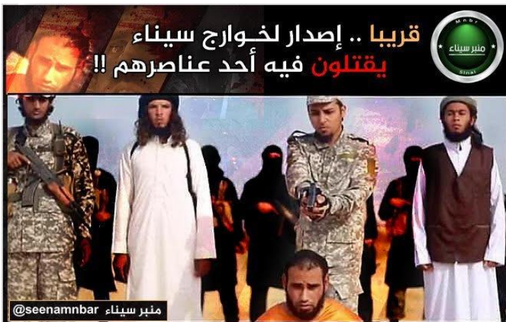
Figure 3: Segment from the video showing an execution, disseminated by the Sinai Province, from the website Jihadology .

Although the storm surrounding Trump's declaration recognizing Jerusalem as the capital of Israel seems to have subsided, a video released in early January by the Sinai Province of the Islamic State (ISIS) in Egypt 6 returned it to the headlines. The video, which denounces the declaration, ruthlessly targets Hamas, which it claims was unable to prevent the declaration, and brands its activists "traitors" and "heretics" guilty of capital offences. 7 It also allegedly that Hamas, along with its parent movement, the Muslim Brotherhood, as well as the Egyptian and Iranian regimes (the latter through its proxies in the Gaza Strip 8 ), are cooperating to prevent Salafi groups from attacking Israel. The video, which was published on online social media and Telegram channels identified with ISIS, has repercussions in two arenas: locally, where the Sinai Province is working to strengthen its image in the Gaza Strip, by provoking Hamas and undermining its legitimacy, and globally, where the video provoked a response from al-Qaeda and its affiliates, as part of the organization's efforts to regain its lead over ISIS for leadership of the global jihad movement, including in Egypt and Sinai.