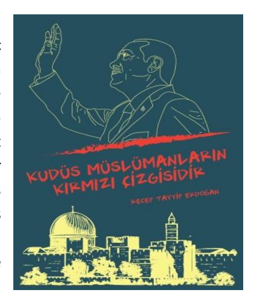
Poster stating: "Jerusalem is the red line for Muslims,".

Erdoğan made exceptionally strident remarks against Israel when he referred to the Hadith of the Prophet Muhammad about the boxthorn tree. According to this text, in the