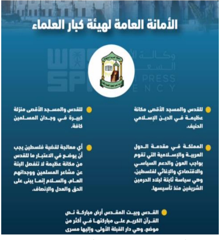
The Five-Point Document, <u>from the Twitter account</u> of the Saudi Press Agency.

The moderate tone adopted by the Saudi government was followed by other officials in the kingdom. For example, on its official Twitter account the Foreign Ministry was careful to present a position similar to that taken by the monarch. Their Tweets on the subject included moderate condemnation of Trump's statement, expressions of support for the and Palestinians, emphasis the importance of implementing the 2002 Saudi peace initiative. However, the Foreign Ministry's Twitter account dealt with the issue of Jerusalem for only two days, before returning to the issue of greatest concern to the Saudi kingdom, namely the Iranian threat. 18