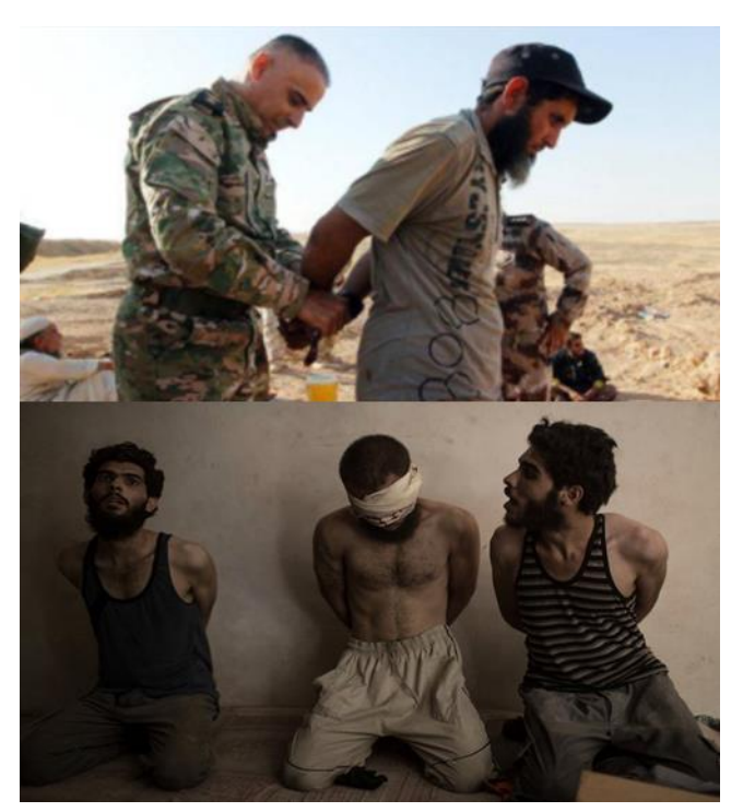
ISIS militants after surrendering to Kurdish Peshmerga forces.

The ongoing defeats and loss of territory, in particular the key strongholds of Huwija and al-Raqqah, spurred a wide-spread surrender of ISIS militants. More than a thousand ISIS combatants turned themselves over to Kurdish Peshmerga forces after fleeing Hawija.<sup>3</sup> This move appeared to follow the order of the local ISIS commander, who feared that any ISIS militants captured by the advancing Iraqi army or the Shi'i Popular Mobilization Forces [ al-Hashd as-Shaabi ] militias would be promptly executed.<sup>4</sup> A similar scenario played out in al-Raqqah, where 100 ISIS militants turned themselves before the SDF had completed the