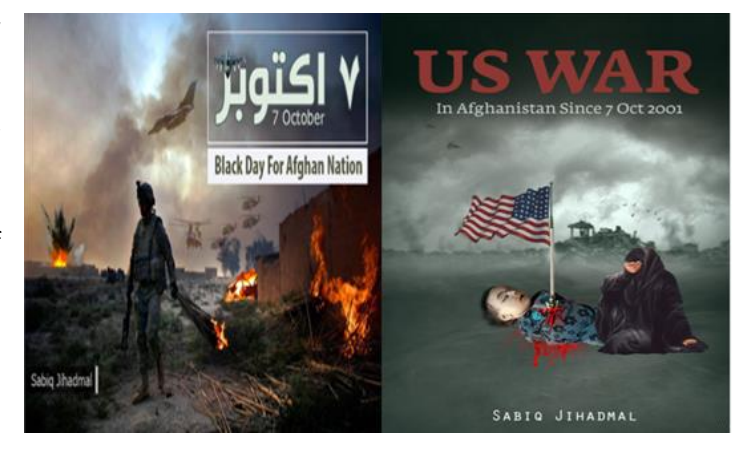
Images from Taliban activists' Twitter and Telegram accounts on the anniversary of the US invasion of Afghanistan

The Taliban took this year's anniversary of the US invasion as an opportunity to recap the extensive damage caused by the protracted war, and to declare its intention to regain control of Afghanistan. "We are determined to force [out] all occupying forces. This is our legal right. We must defend with our souls our liberty, our selfdefinition, the Islamic [governmental] system, and our people," a statement