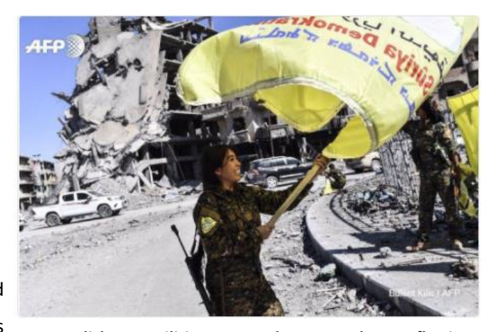
A Kurdish YPG militia commander waves the SDF flag in al-Raqqah.

Various bodies the affiliated with international coalition have taken advantage of the recent events and use them to undermine the political legitimacy of ISIS and portray it as a failure. In the wake of the Hawija takeover, the Sawab Center<sup>13</sup> – a joint US-UAE venture for fighting the ISIS narrative online - tweeted in Arabic that "thousands of ISIS fighters