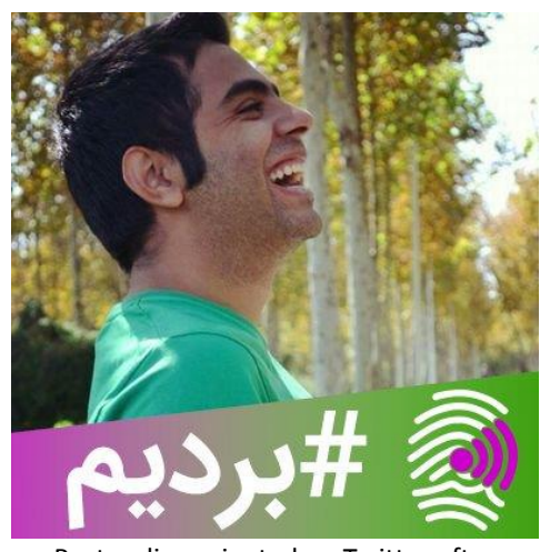
Poster disseminated on Twitter after Rouhani's election victory, with hashtag "We won"

The 2017 presidential election campaign was characterized by widespread use of SNS by all candidates in their efforts to mobilize public support. Unlike previous campaigns, use of SNS was not restricted to the president's reformist supporters, whose presence on the Internet has been widespread for years. Conservative contenders, headed by Raisi, had a significant SNS presence as well, newly acknowledging SNS' great influence and effective conveyance of messages to mass audiences. As the election drew closer, conservative candidates increasingly used SNS to elicit support from citizens, especially young people. A few days before the election, Raisi made an ill-fated effort to increase his visibility by uploading a photograph of himself with Iranian rapper Amir Tataloo. The picture was apparently intended to improve Raisi's image among young voters, but instead provoked ridicule. The conservative cleric is known for his vehement opposition to any hint of Western culture permeating Iranian society, including Western music, and was therefore accused of opportunism.