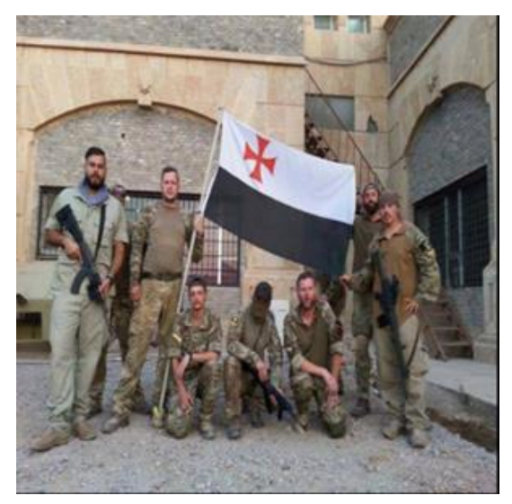
A picture from the Facebook page of the Britain First movement, with the caption "Brave anti- ISIS volunteers waving the Templar flag in Syria!"

threat, and in the Christian countries of Europe and North America, wherever there are Muslims who identify with the Salafi-Jihadi ideology. The use of