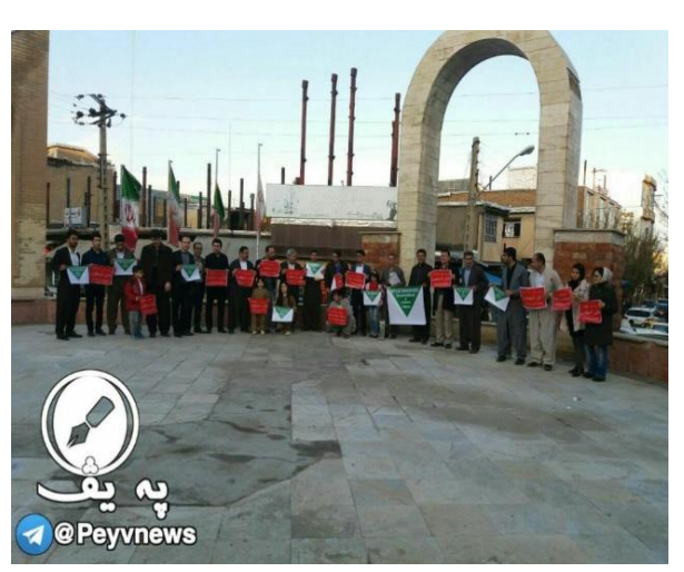
Demonstration of solidarity with the victims of the chemical attack in Syria, with the participation of the families of the victims of the Iraqi chemical attack against Iran in June 1987.

In the days leading up to the American attack in Syria, Iranian social networks were strongly critical of the chemical attack on Idlib, although users disagreed on the identity of the perpetrator. While some blamed President Assad, others claimed he would have no interest in using chemical weapons, considering his significant gains in the war. Regardless, Iranian criticism of the use of chemical weapons in the Syrian civil war is not a new phenomenon. This sensitivity draws on Iranian victimization in chemical attacks by Iraqi ruler Saddam Hussein during the Iran-Iraq war.