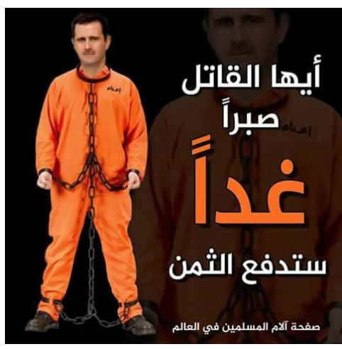
A poster condemning Assad, with the caption "Just wait murderer: Tomorrow you will pay the price," from Twitter.