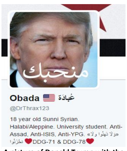
A picture of Donald Trump with the words "We love you," from Twitter.