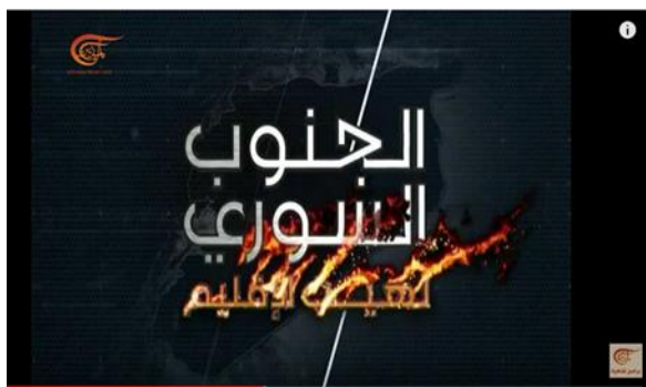
The title of al Mayadeen's investigative report