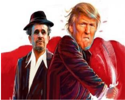
“Populists Unite”: From the cover of the Iranian Weekly “Sada”

The results of the US presidential elections sparked a variety of responses in Iran, ranging from restraint, expressions of concern about the future, and even satisfaction with the results. The lively, witty, and sharp discourse that developed on SNS testifies to users’ high level of awareness. They expressed not only familiarity with the potential impact of the results of US policy towards Tehran, but also attempted to apply