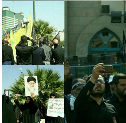
Members of the extreme Islamic group Ansar-e-Hezbollah demonstrating against holding the Iran-South Korea soccer match. From Telegram on October 7, 2016

Users of SNS responded strongly to the opposition some clerics voiced to the soccer game. Many of them called the response of radical clerics "stupid" or "ridiculous," and said that the public could be trusted to respect the spirit of the day of mourning even if the soccer match was held as scheduled. Some derisively suggested that instead of cheering after scoring a goal, fans would flagellate themselves, as customary among Shi'ites as a sign of mourning. 31 To illustrate this idea, a user uploaded a long video to Twitter, showing a previous match between Iran and South Korea with an audio track of mourning ceremonies, including self-flagellation and cries of grief, inserted after each goal scored by the Iranian national team. This video was shared hundreds of times. 32