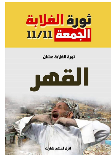
Flier advertising the “Revolution of the Poor” protest scheduled for Nov. 11, 2016.

The regime’s political rivals took the opportunity to intensify their criticism of the government and President al-Sisi. For example, the April 6 Movement, a secular organization of Egyptian young people, published a PR video on the economic decline of Egypt under the al-Sisi regime and the collapse of the Egyptian pound against the strengthening American dollar. An Egyptian journalist identified with the Muslim Brotherhood urged readers to continue feeding the discourse so that the issue would remain on the agenda. 12 The Qatari network al-Jazeera-Egypt also made a conspicuous contribution to the escalating criticism by broadcasting interviews and articles about increases in the prices of food, fuel, clothing and cigarettes in Egypt. 13 Moreover, activists in the Muslim Brotherhood and young, politically-unaffiliated, secular Egyptians encouraged citizens suffering from the high cost of living to take to the streets on November 11 in a massive demonstration being called, “The Revolution of the Poor” (see picture). 14