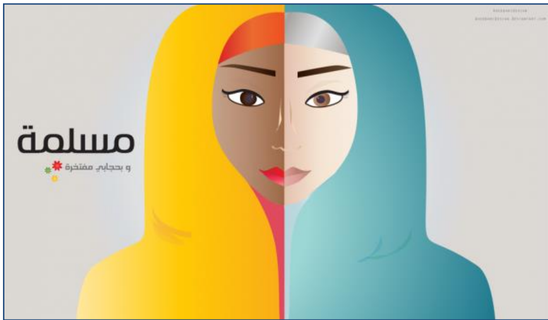
Figure 1. Image from the website of the Northern Branch of the Islamic Movement in Israel.