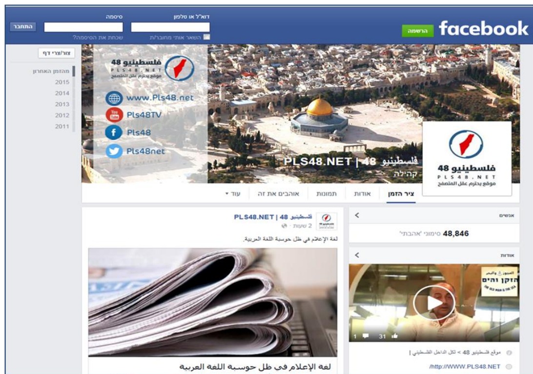
Figure 2. The Facebook page of the Northern Branch of the Islamic Movement, January 2016