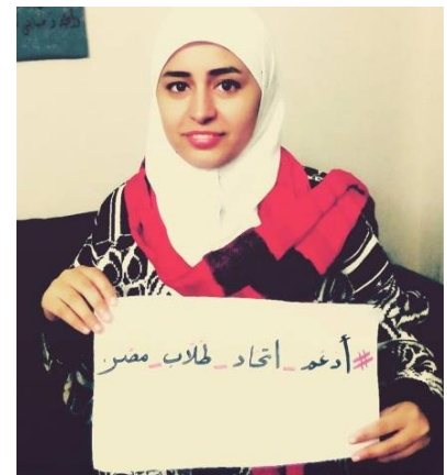
Former head of the Students’ Union at Ain Shams University and current voluntary president of Roshte Association for Medical Education showing her support for the struggle of the Egyptian Students’ Union

The decision to disperse the current Students’ Union aroused great anger and sparked protests on Facebook and Twitter using the hashtag “I support Egypt’s Students’ Union” ( Adam Ittihad al-Tullab Misr ). Students across the country expressed their frustration on SNS and called for applying pressure on decision-makers to make them change their mind. 3 According to many students, the regime’s blatant interference in the elections exacerbated the crisis of confidence between the younger generation and the regime, which keeps young people from political life, and is considered a symbolic return to Mubarak’s dictatorial regime. From their perspective, the Egyptian regime nurtures student groups that obey its commands, while simultaneously cutting off those that could threaten its stability. Others noted that the time has come to accept that the military regime prefers to impose its will “and take the people’s will and choices out with the garbage.” Students also claimed that young secular people erred when they did not continue the revolution in January 2011, stressing that, “the people’s memory is short, (and) the military does not know what democracy is.” Some even expressed concern about the outbreak of popular protests on campuses at the beginning of the second semester, if the government does not retract its decision to dismantle the Students’ Union. 4