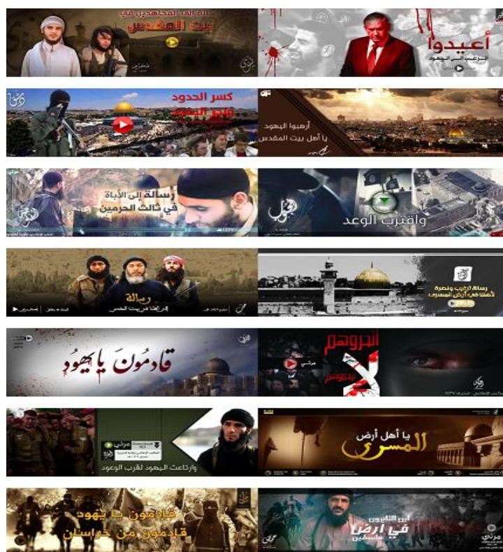
Islamic State’s anti-Israel video campaign

domination over Palestine. All of them show at least one activist of the Islamic State delivering the message fluently, while facing the camera, armed and dressed in uniform. The speakers in the videos typically introduce the general idea of the campaign or clip at the beginning of their speech. Towards the end, the videos make direct threats against their enemies. The campaigns are intensively distributed on SNS with specific hashtags, for a limited period of time. In the campaign against Saudi Arabia, supporters of the Islamic State posted requests to share the videos with the hashtag اصبروا الوحي بلاد يا (“Oh land of revelation, be patient”), which became the campaign’s slogan. 13 The leading hashtag used when distributing anti-Israel videos was نحر اليهود (“slaughter the Jews”), and the chosen hashtag for campaign addressing al-Shabaab was أيها المجاهد في الصومال (“Oh warrior of jihad in Somalia”).