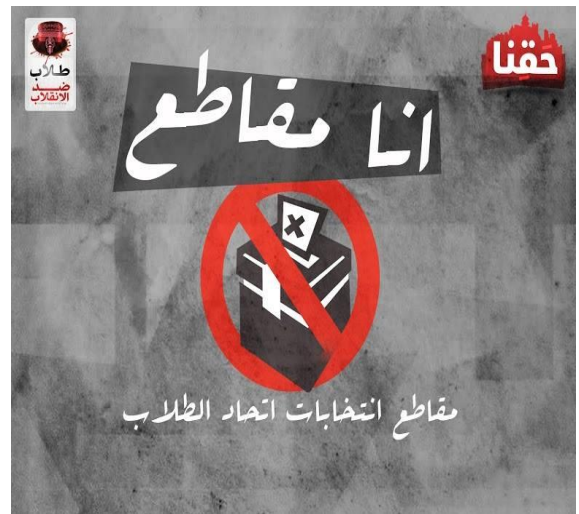
Flyer published by students supporting the Muslim Brotherhood, calling for a boycott of the Student Union elections in Egypt

The Egyptian Students' Union is an umbrella organization of all government and private universities. It was founded in 2011, after the overthrow of President Mubarak. However, when President Mohamed Morsi was removed from office in July 2013, the union's elections were frozen. The freeze was initiated by allies of the new president, Abd al-Fattah al-Sisi, who sought to "cleanse" the universities of groups affiliated with the Muslim Brotherhood, which had been declared a terrorist organization. Two-and-a-half years later, in November 2015, the union's elections were resumed. However voter turnout was low, with only 30% of the students in Egypt participating. A likely contributing factor, among others, was a campaign waged on SNS by students who support the Muslim Brotherhood; they called for a boycott of the elections under the slogan "Our right" ( haqqna ), protesting the military coup of al-Sisi and the subsequent suppression of individual freedom in Egypt. 1