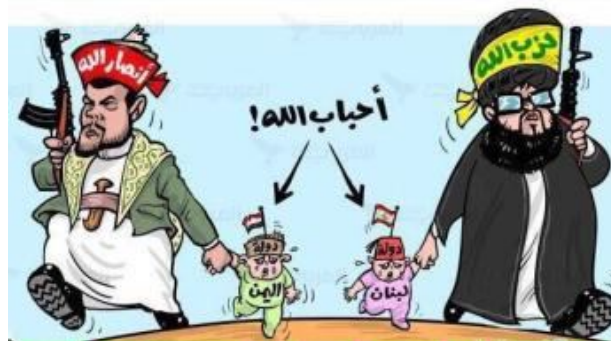
Cartoon uploaded to SNS: On the right Nasrallah of Hezbollah, holding the hand of baby “State of Lebanon.” On the left Hussein al-Houthi, leader of the Houthis in Yemen, holding the hand of baby “State of Yemen.” Above the babies, it says “Love of God.”

The discourse on SNS about the conquest of Sana’a is indicative of the real anxiety and distress felt by residents of the Sunni Arab Gulf states. They see Iran as constantly striving, successfully, to expand its influence. The “swallowing” of Yemen by Iran is, therefore, another link in the chain of Iranian conquests of Arab territory, as were Lebanon, Syria, and Iraq, that have become its pawns on the way to regional hegemony. Users of SNS emphasize the urgent need to meet this danger not only with diplomatic action but also through physical force, a belief that almost goes unmentioned in the official channels of traditional media.