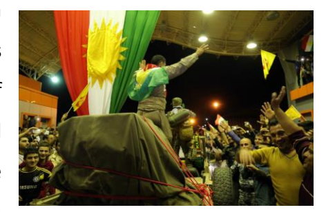
Turkish citizens of Kurdish origin welcome Peşmerge fighters on the border between Turkey & Iraq

and internal pressure applied by the Kurds, the Turkish government finally agreed to allow Turkish fighters to pass through its territory. This agreement led to a further round of reactions, on both sides, on SNS. While the Kurds celebrated the opening of the border crossing, both online and in the streets, by flying the flag of Kurdistan (see picture), Turkish nationalists expressed concern that the presence of Peşmerge would reinforce the PKK over the border.<sup>14</sup>