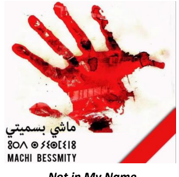
Not in My Name

In Morocco, a group of politicians, media personalities, intellectuals and young activists launched a similar campaign on SNS in Arabic, Amazight (the language of Berber minority), and French. The declared purpose of the campaign was to eradicate "the barbaric actions taken by bloodthirsty extremists who can in no way be associated with Islam." Some participants uploaded protest videos and added the campaign's logo to their accounts. The logo shows a